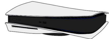
Playstation 5 2020/2021