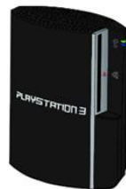
Playstation 3 2006/2007