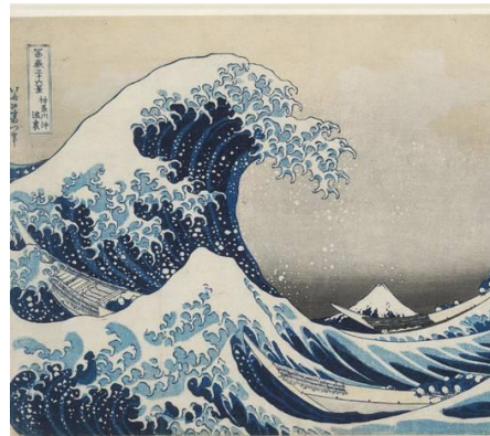
Hokusai British Museum