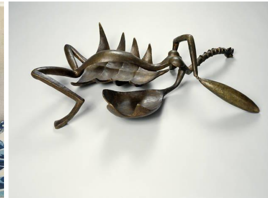
Alberto Giacometti Tate Modern

Be prepared to make notes and drawings whilst in the exhibition however, we prefer you not to buy a sketchbook for the course yet. (Use a small book or loose paper)