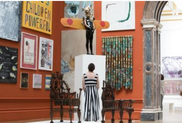
Summer Exhibition 2017 Royal Academy