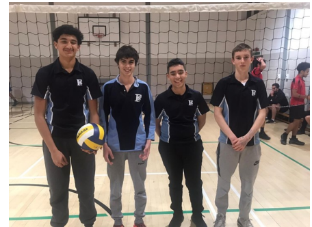
Borough Runners Up – Y10 Volleyball Team!

Our Y10 Boys Volleyball team travelled to STM for the annual Haringey Borough Championships. Despite a lack of practice time the boys performed amazingly well and were just pipped to the Gold medal by the host school. However their 2 nd place was a real achievement and we are all very impressed by their efforts! Superb Boys!