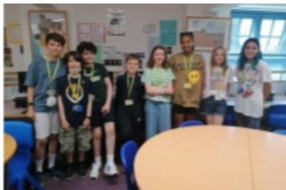
Picture: Year 7 Students at the event