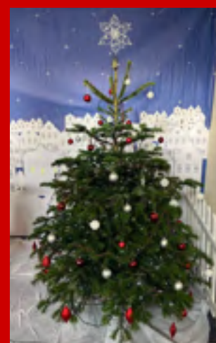
SW Foyer looking festive