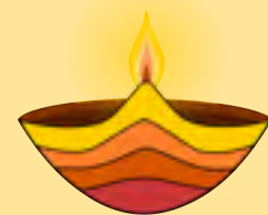
Diwali 24 October 2022