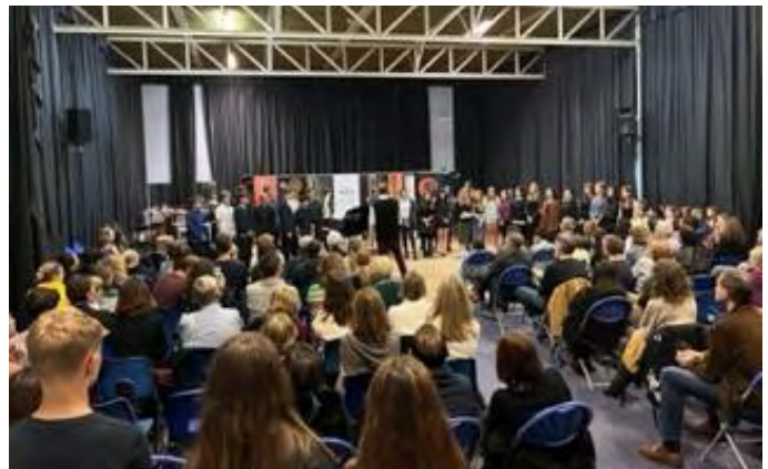
Welcome music concert 13/10/2022