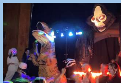
Year 7 Halloween disco fun!