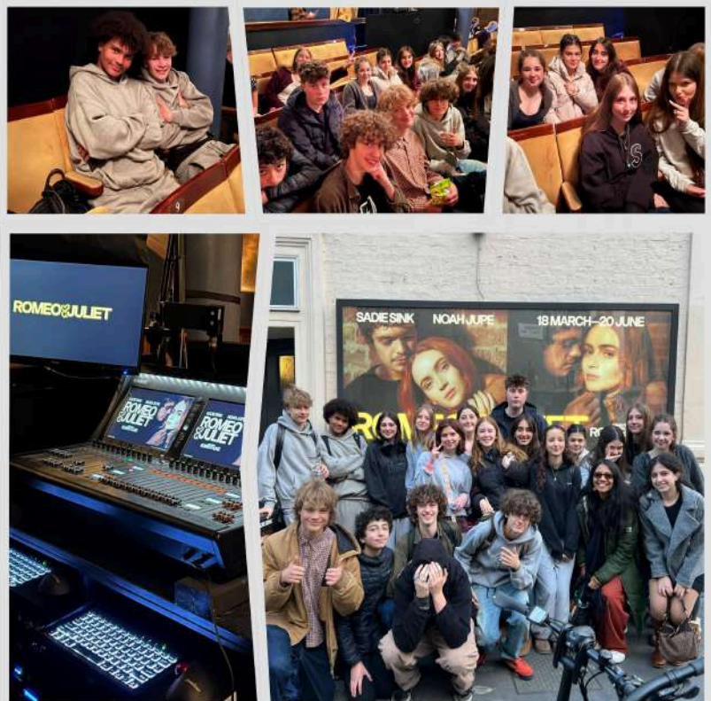
Romeo & Juliet at The Harold Pinter Theatre