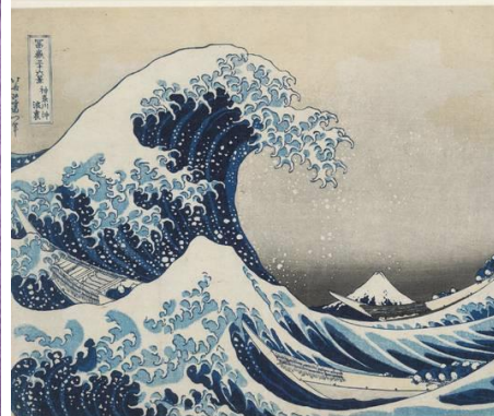
Hokusai British Museum