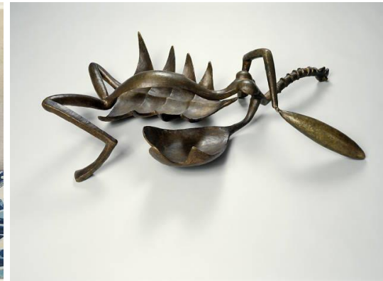
Alberto Giacometti Tate Modern

Be prepared to make notes and drawings whilst in the exhibition however, we prefer you not to buy a sketchbook for the course yet. (Use a small book or loose paper)