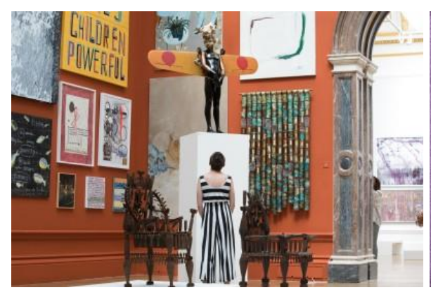
Summer Exhibition 2017 Royal Academy