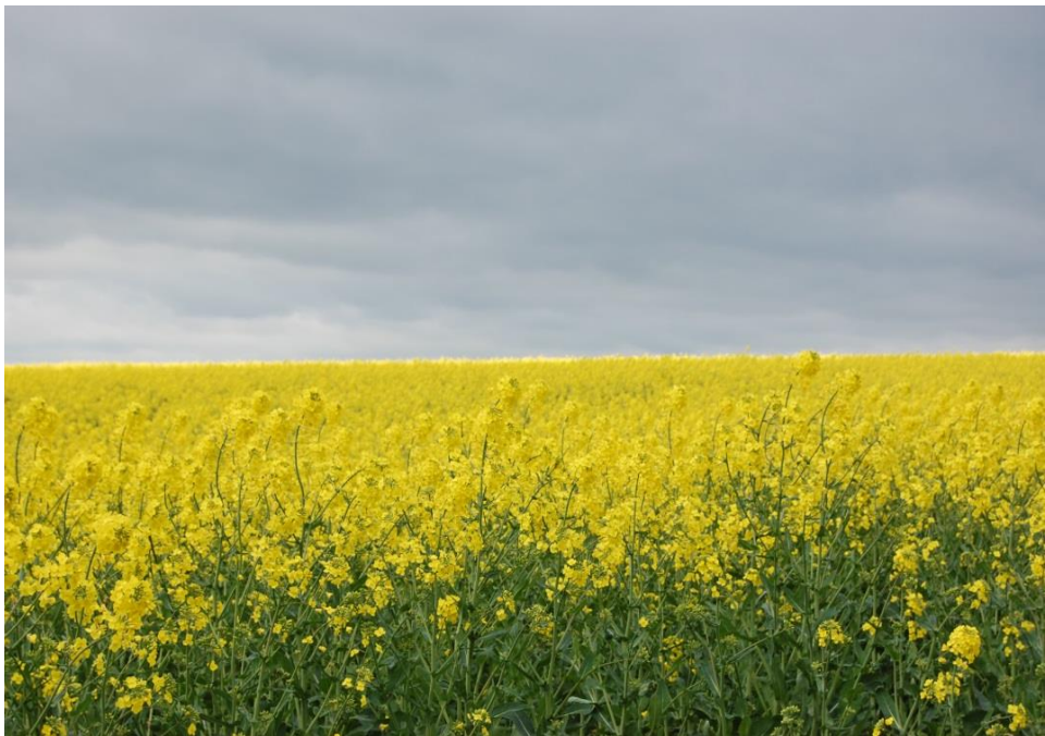
Owen Graham (Yr 8)