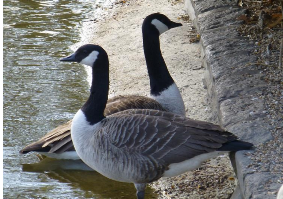
Mirei Kong (Yr 8)