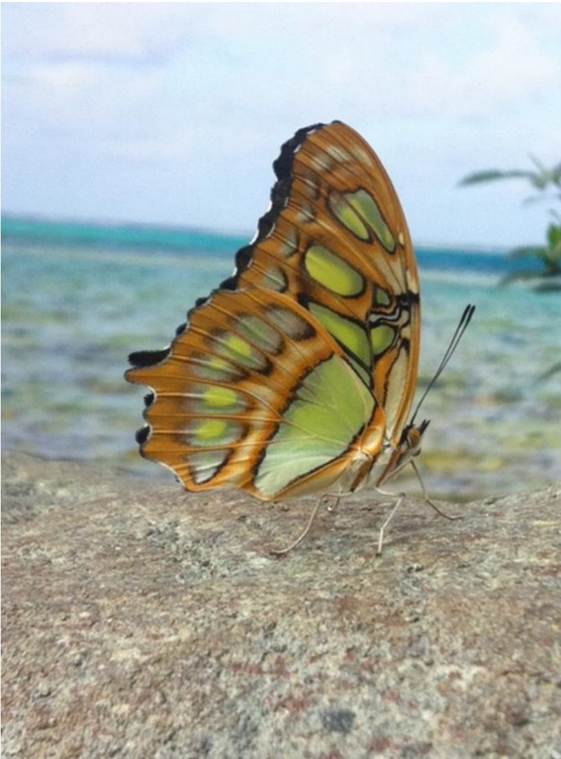
Anouska Atureliya (Yr 8)