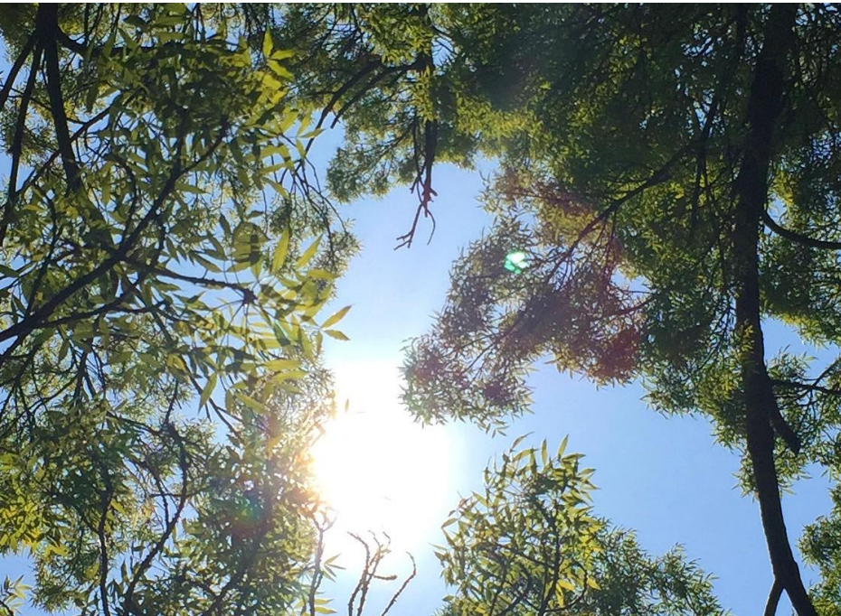
Aiya Brouk (Yr 9)