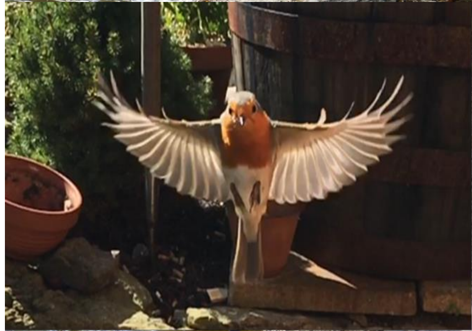
Jude Crook (Yr 9)