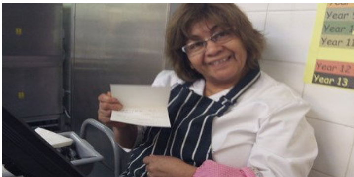
Thank you cards for the Canteen Staff

C3 gave an assembly to the College encouraging us to perform random acts of kindness. To set us off and give us ideas, they performed many of their own.