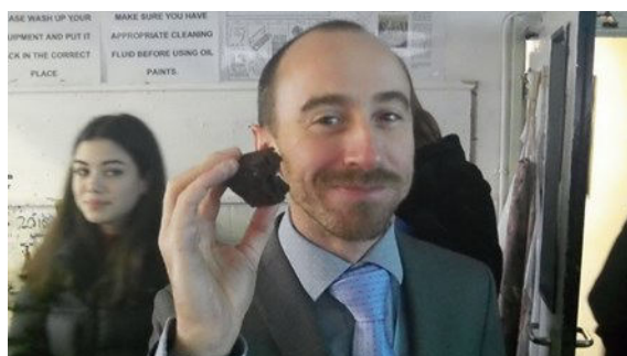
Throwing a party for another form