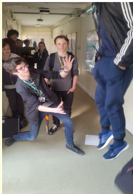
To win, students had to demonstrate that they were able to use the force.