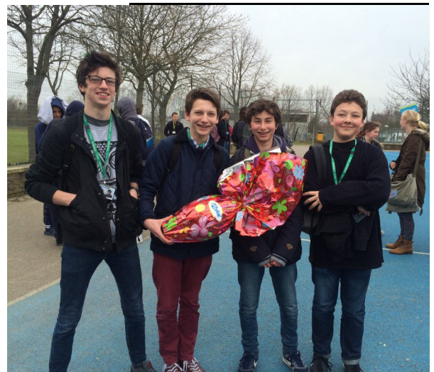
The winners receive their prize.