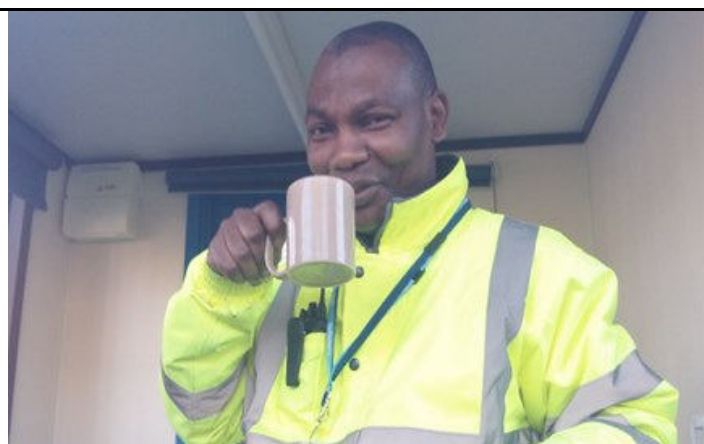
A mug of tea to the man on gate duty.