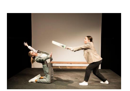
One Man, Two Guvnors