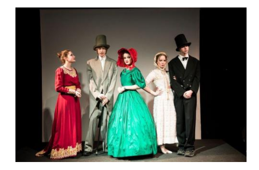
The Importance of Being Earnest