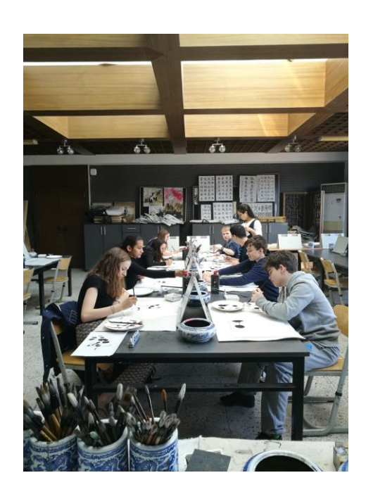
Chinese Painting Lesson