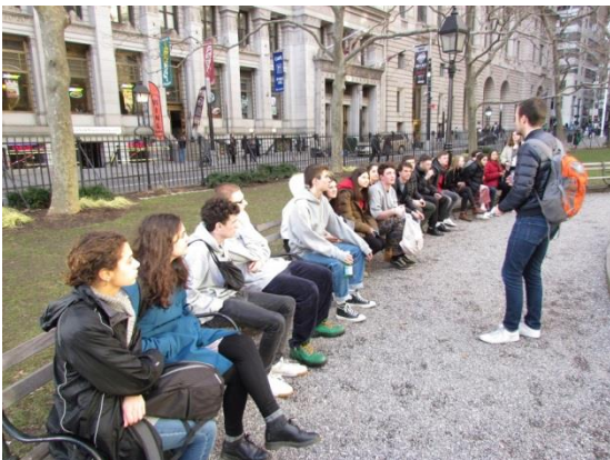
On a walking tour of Manhattan – Bowling Green Park and Wall Street.

The students maintained good humour and engagement through jetlag, 60 miles of walking across the five days, cold weather, and a record snowfall on our second day resulting in the cancellation of our planned visit to the Bronx secondary school and the Tenement Museum. As a group and as individuals, the students on the trip were a credit to the school. We hope that every student enjoyed the trip and found that it provided useful context for their A-Level studies.