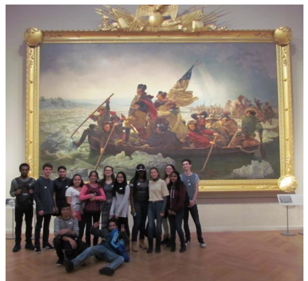
With the American students in the Metropolitan Museum of Art