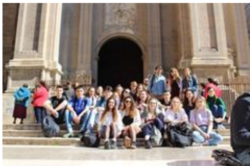
In front of La Catedral de Granada