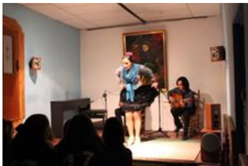
During the Flamenco show