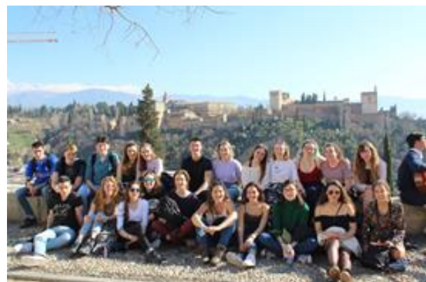
Whole group picture with La Alhambra as background