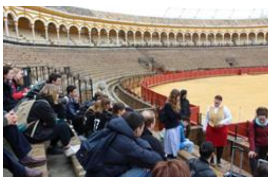
Visit to La Plaza de Toros Real Maestranza en Sevilla