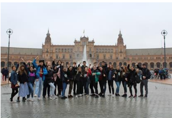
Whole group Picture in La Plaza de España in Sevilla

The students showed great enthusiasm through the trip despite the long walking distances and the overdose of information in Spanish. They greatly enjoyed the sunny weather and even experienced 2 rainy days without complaining! They were a credit to the school and made all of us really proud.