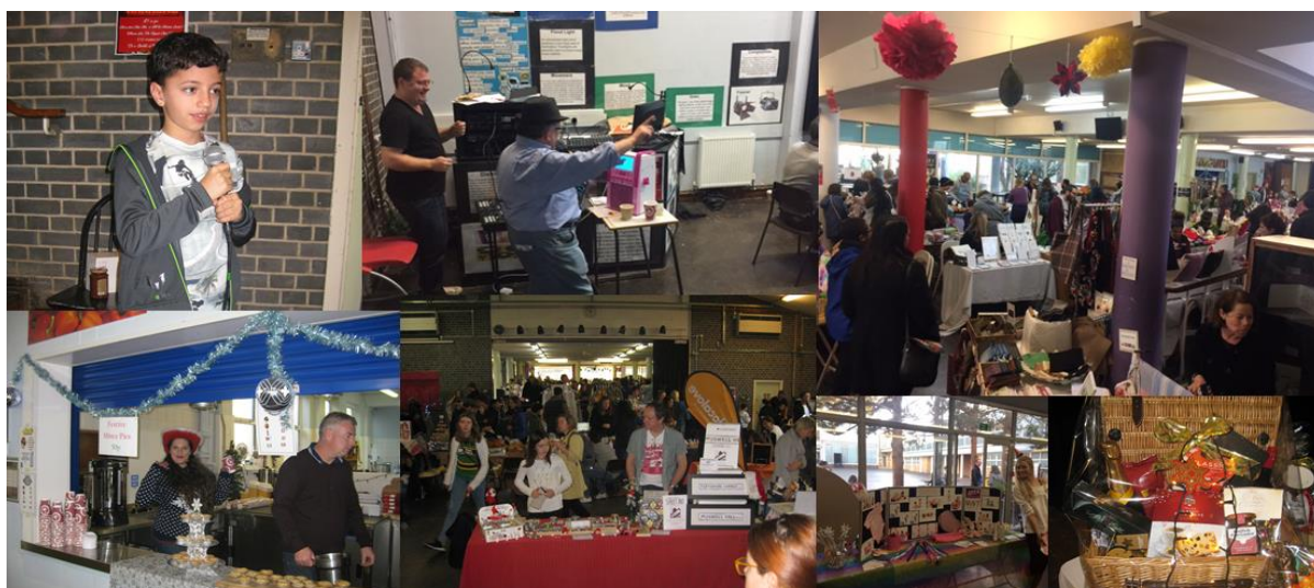
Fundraising figures Sep – Dec 2016